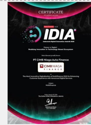
Maret 2025 Warta Ekonomi The Most Innovative Digitalization of Multifinance 2025 for Enhancing Customer Experience with Advanced Digital Services