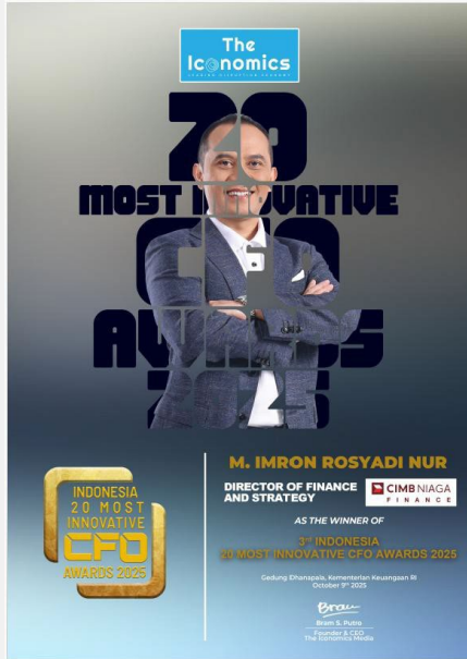
3 rd Indonesia 20 Most Innovative CFO Awards 2025