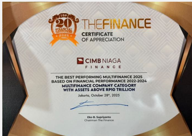
The Finance Golden Star Award 2025 - Top 20 Financial Institution selama lima tahun berturut-turut