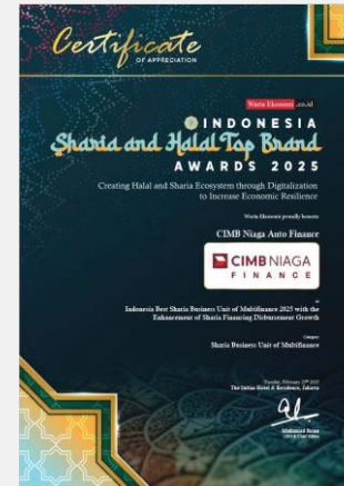
February 2025 Warta Ekonomi Indonesia Sharia and Halal Top Brand Awards 2025