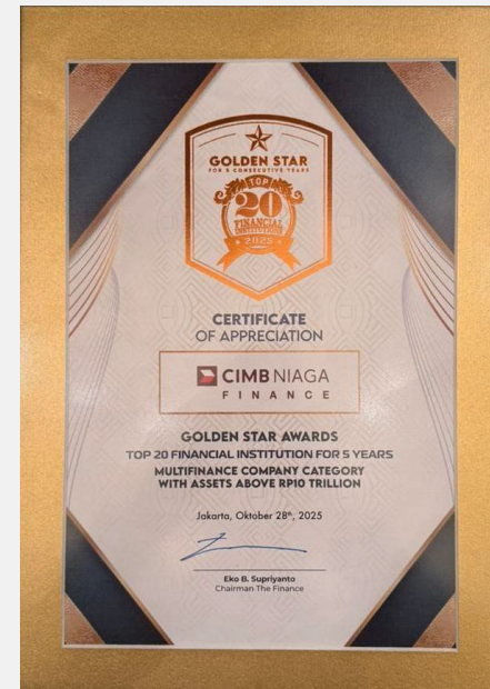
Top 20 Financial Institution 2025 - kategori Perusahaan Pembiayaan Beraset 10 Triliun ke Atas berpredikat "Sangat Bagus"