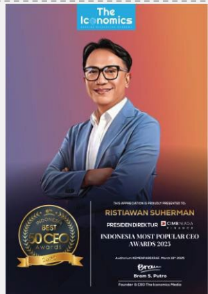
Maret 2025 The Iconomics Indonesia Most Popular CEO Awards 2025