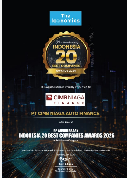
Januari 2026 The Economics Indonesia 20 Best Companies Awards 2026 In Multifinance Category