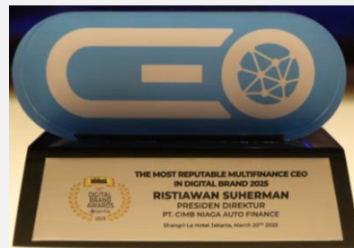
Maret 2025 Infobank The Most Reputable Multifinance CEO in Digital Brand 2025