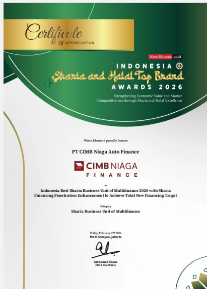
Februari 2026 Warta Ekonomi Indonesia Best Sharia Business Unit of Multifinance 2026 with Sharia Financing Penetration Enhancement to Achieve Total New Financing Target Category Sharia Business Unit of Multifinance