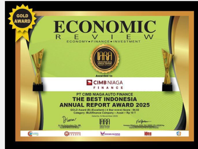
November 2025 Economic Review The Best Indonesia Annual Report Award 2025