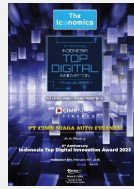
February 2025 The Iconomics Indonesia Top Digital Innovation Award 2025