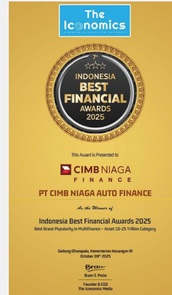
7 th Indonesia Best Financial Awards 2025