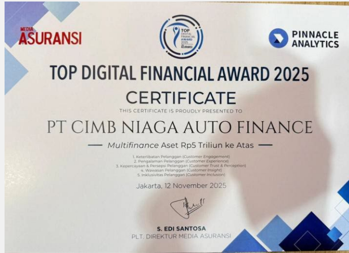
November 2025 Media Asuransi Top Digital Financial Award 2025 Multifinance Aset Rp5 Triliun ke atas