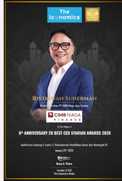
Januari 2026 The Economics 20 Best CEO Syariah Awards 2026 In Multifinance Category