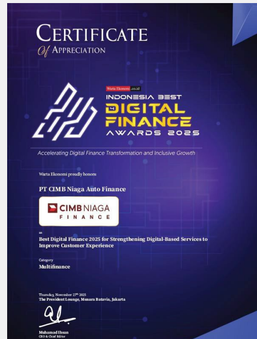
November 2025 Warta Ekonomi The Best Digital Finance 2025 for Strengthening Digital-Based Services to Improve Customer Experience