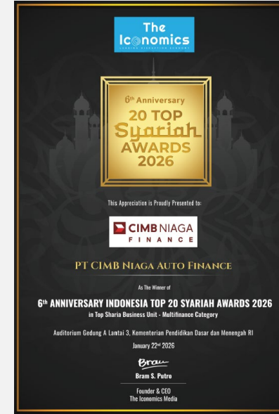
Januari 2026 The Economics Indonesia Top 20 Syariah Awards 2026 in Top Sharia Business Unit – Multifinance Category