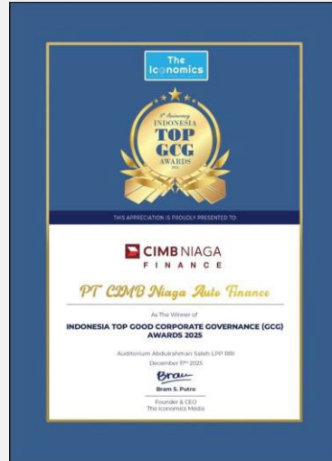
Desember 2025 The Economics Indonesia Top GCG Award 2025