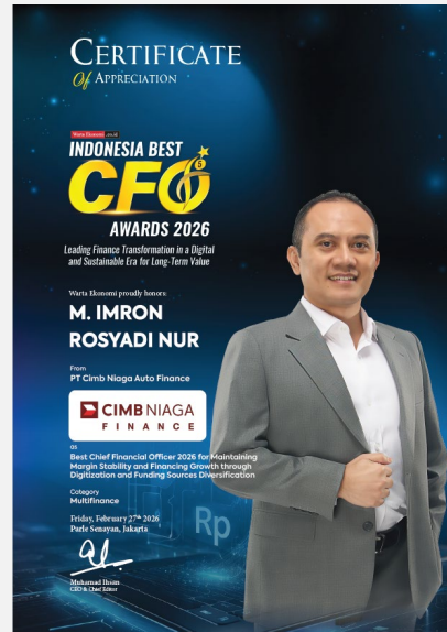
Februari 2026 Warta Ekonomi Best Chief Financial Officer 2026 for Maintaining Margin Stability and Financing Growth through Digitization and Funding Sources Diversification Category Multifinance