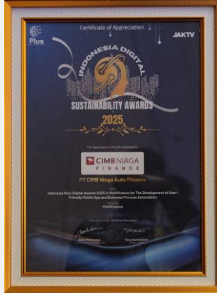
February 2025 JAKTV INDONESIA DIGITAL SUSTAINABILITY AWARDS 2025 : "Creating Digital Ecosystem through Sustainable and Inclusive Business"