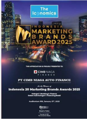
Januari 2025 The Iconomics Indonesia 20 Marketing Brands Awards 2025 In Banking & Finance Category