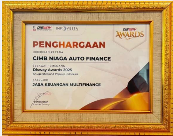
Desember 2025 Disway Group