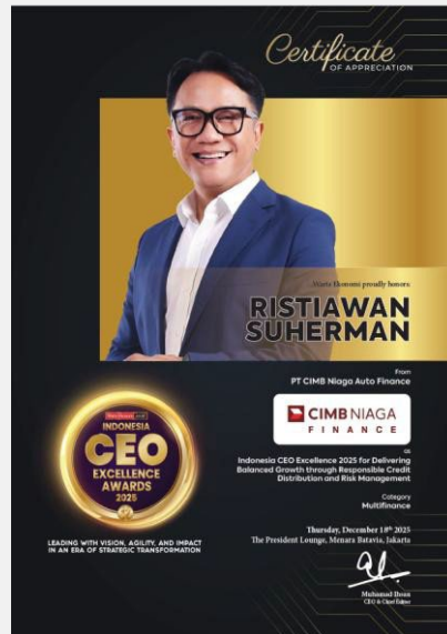
Desember 2025 Warta Ekonomi Indonesia CEO Excellence 2025