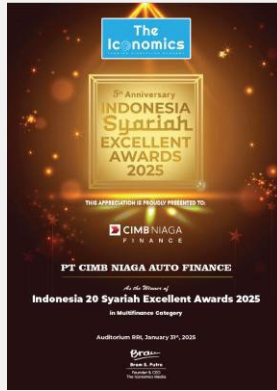
January 2025 The Iconomics Indonesia 20 Syariah Excellent Awards 2025 in Multifinance Category