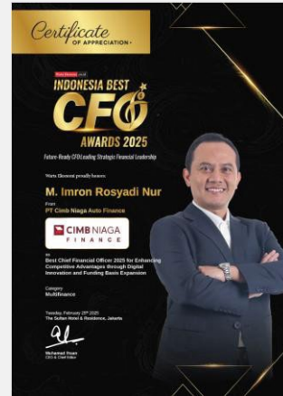
February 2025 Warta Ekonomi Indonesia Best CFO Awards 2025